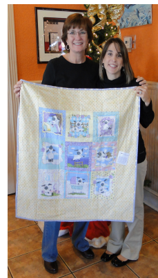
Request and receive a Prayer Quilt!