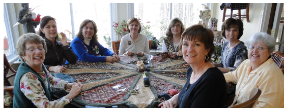
Making the sanctuary's Christmas Tree skirt.